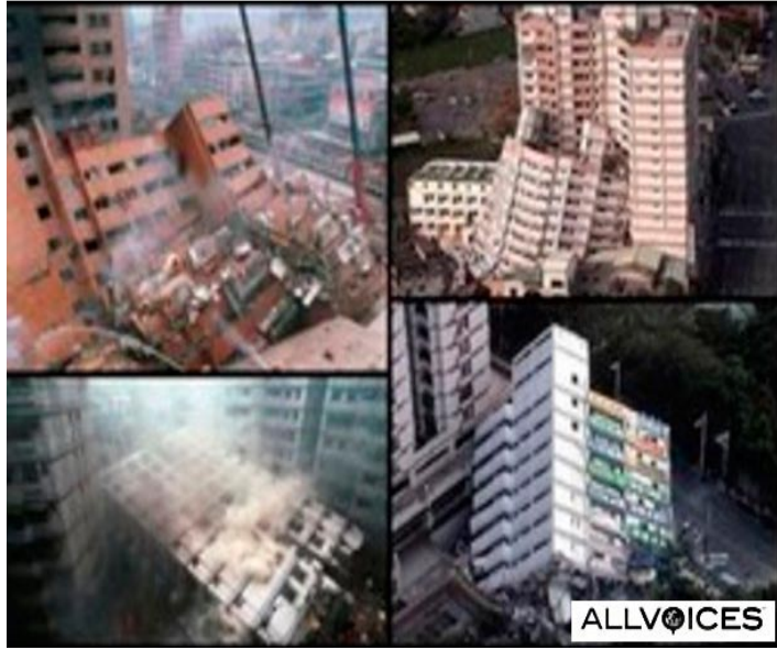
Photo collage created and posted online at www.allvoices.com showing several damaged Japanese sky scrapers as a result of the 9.0 magnitude earthquake that shook Japanese cities March 11.