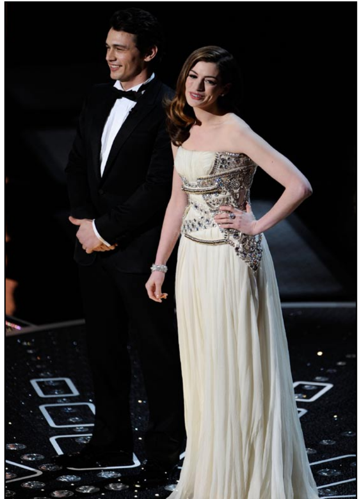
Actors James Franco and Anne Hathaway host the Academy Awards.

Best Picture: The King's Speech Actor in Leading Role: Colin Firth Actor in Supporting Role: Christian Bale Actress in Leading Role: Natalie Portman Actress in Supporting Role: Melissa Leo Animated Feature: Toy Story 3 Art Direction: Alice in Wonderland Cinematography: Inception Costume Design: Alice in Wonderland Directing: The King's Speech Documentary Feature: Inside Job Documentary Short Subject: Strangers No More Film Editing: The Social Network Foreign Language Film: In a Better World Makeup: The Wolfman Music (Original Score): The Social Network Music (Original Song): Toy Story 3 "We Belong Together" Short Film (Animated): The Lost Thing Short Film (Live Action): God of Love Sound Editing: Inception Sound Mixing: Inception Visual Effects: Inception Writing (Adapted Screenplay): The Social Network Writing (Original Screenplay): The King's Speech