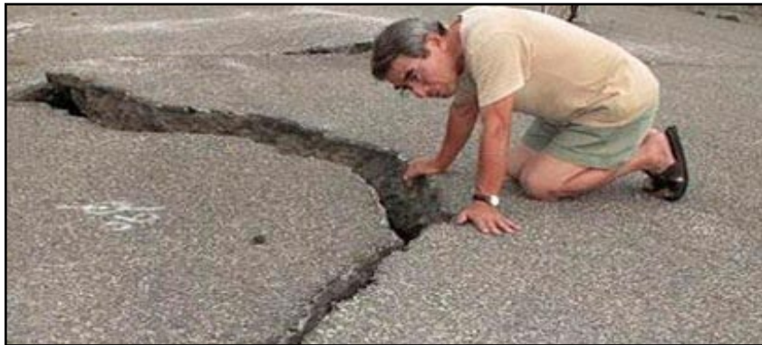
One man examines a large crack after the 9.0 earthquake in Japan Friday March 11.

Japan manufactures many technological devices and is home to companies such as Sony and Toyota. Global financial effects are expected.