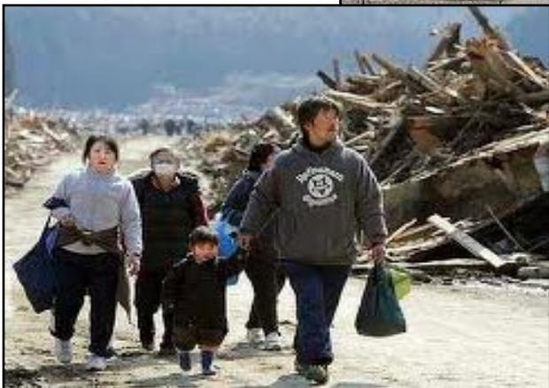
Top left -- Japanese mother and child try to stay warm and wait for relief