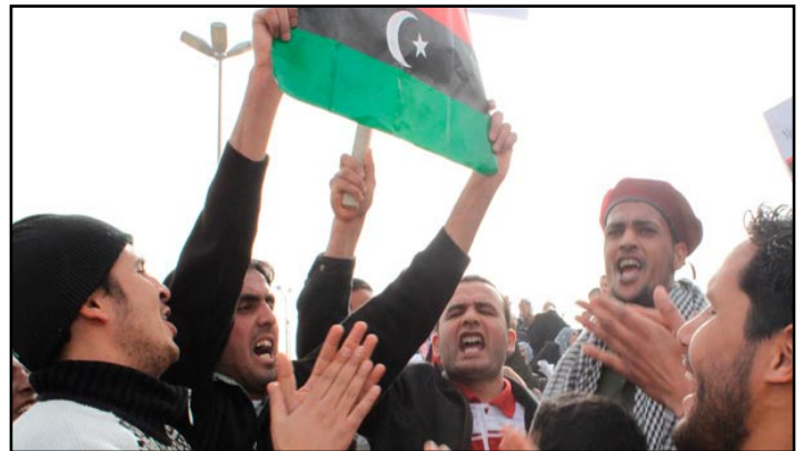
Protesters in Benghazi, Libya demonstrate against the nation’s leader Moamar Gadhafi and call for democracy in their nation.

unprecedented anti-government rebellions.” The current focus of political unrest in the Middle East is Libya. Libyan citizens began protests against the government on Feb. 15. Libyan leader Moamman